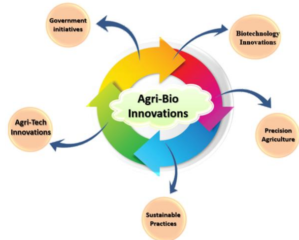
Fig. 1. Factor influencing Agri –bio innovation.

(i) Gene-Editing Technologies. Genome Editing techniques have upset crop rearing in numerous researchers who perform genome Editing currently use CRISPR. Specialists presently ordinarily use CRISPR to control the genome for various applications, including practical genomics, diagnostics, DNA imaging, and therapeutics. CRISPR-Cas9 innovation caused a significant mix in the field of genome designing when it was first portrayed as an Editing device in 2012, and it has gained surprising headway in the mediating years. From that point forward, researchers have gone through many years attempting to uncover ways of editing the genome that offset explicitness with time and cost (Public Human Genome Exploration Foundation (NHGRI, 2019). Here are the 7 fruitful methodologies that researchers have used to adjust DNA up to this point (Fig. 1, 2 & Table 1).