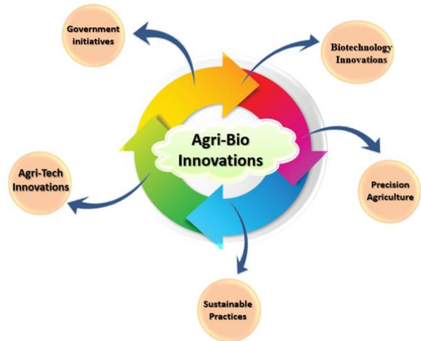
Fig. 1. Factor influencing Agri –bio innovation.

(i) Gene-Editing Technologies. Genome Editing techniques have upset crop rearing in numerous researchers who perform genome Editing currently use CRISPR. Specialists presently ordinarily use CRISPR to control the genome for various applications, including practical genomics, diagnostics, DNA imaging, and therapeutics. CRISPR-Cas9 innovation caused a significant mix in the field of genome designing when it was first portrayed as an Editing device in 2012, and it has gained surprising headway in the mediating years. From that point forward, researchers have gone through many years attempting to uncover ways of editing the genome that offset explicitness with time and cost (Public Human Genome Exploration Foundation (NHGRI, 2019). Here are the 7 fruitful methodologies that researchers have used to adjust DNA up to this point (Fig. 1, 2 & Table 1).